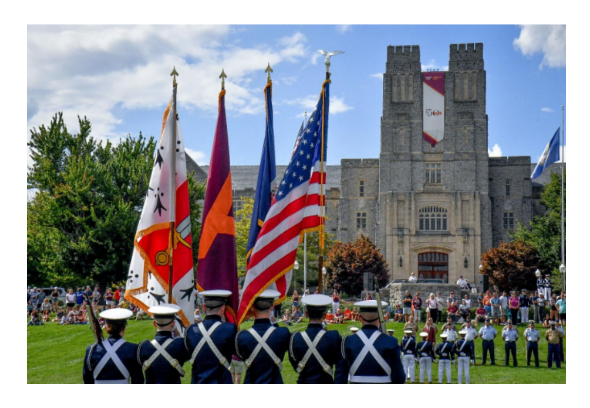
In the U.S. News & World Report list of "2024 Best Colleges", Virginia Tech tied for 47th overall among national universities, tied for 20th among public ones, and tied at 25th for "Most Innovative." It ranks in the top 6 percent of universities in the nation for research expenditures, and is ranked 54th in the National Science Foundation's Higher Education Research and Development Survey.